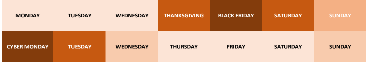
Figure 1: Sales Intensity Through Black Friday and Cyber Week, 2018

Cyber Monday sales are quickly spreading to neighboring days. Over the past four years, online sales on Cyber Monday have averaged two and a half times more dollars spent than those on an average day. Black Friday sees a higher spike, at three and a half times, while the days after Black Friday and Cyber Monday see spillover sales of twice that of an average day. Ecommerce giants such as Walmart, Target, and Amazon have started to announce Black Friday deals a week before Thanksgiving and sales lasting for the entire week following (see figure 1). The implementation of same-day shipping has made this expansion even easier. These giants often set the pace for the rest of the industry to follow. Will we see a two-week long holiday sale next year?